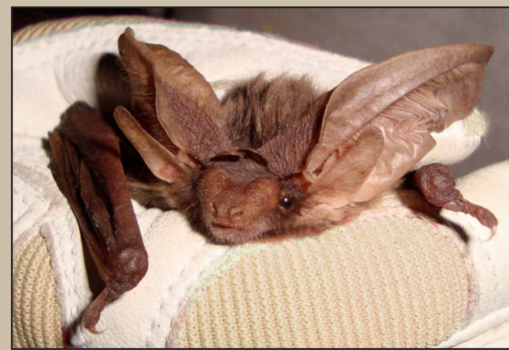
Allen's Lappet-browed Bat

Many animals, ranging in size from tiny birds to large mammals, find homes in Oak Creek Canyon's ponderosa pine forest.